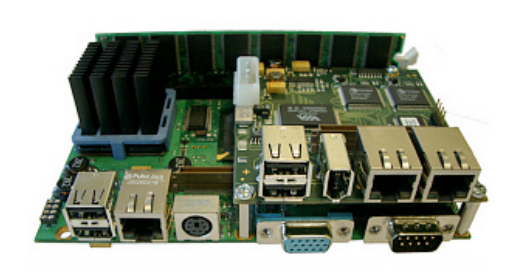
JRex-VE 300MHz JFLEX-Communication SDRAM-DIMM mounted