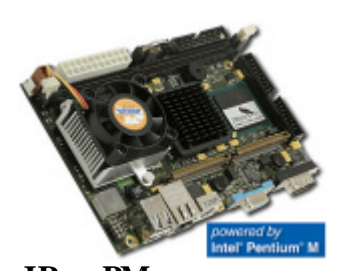
JRex-PM Intel® Pentium® M 1.1 / 1.6GHz