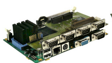
JRex-VE 300MHz JFLEX-SERIALGPIO

Please see the following JRex/JFLEX ^{\text{TM}} bundles - to get a profound understanding of its advantages, complexity and feature set: