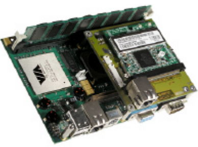
JRex-VE, no cooler JFLEX-MiniPCI-II WLAN card mounted SDRAM-DIMM mounted