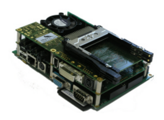
JRex-VE 300 JFLEX-Multimedia1 JFLEX-PCMCIA1 SDRAM-DIMM mounted CompactFlash mounted