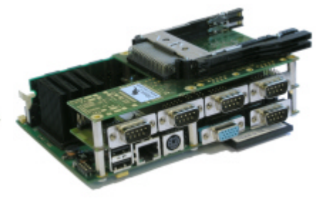
JRex-VE 300 JFLEX-SERIALGPIO1 JFLEX-PCMCIA1 SDRAM-DIMM mounted CompactFlash mounted